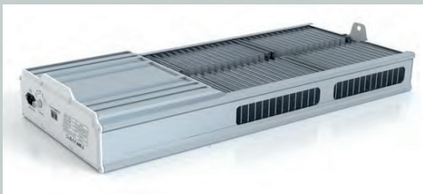
Retrofit 1 1 HPS replacement

The LED that is a direct replacement for HPS. With a footprint designed to fit seamlessly in existing HPS layouts, the LED RENO 820W is a highly energy efficient LED delivering serious growing power. The LED RENO 820W